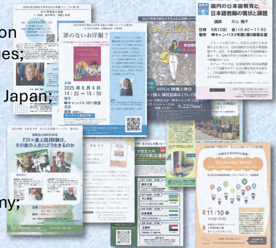
Fliers of 2025 CMPS Forums

Publications – Three working papers were published on the following themes: